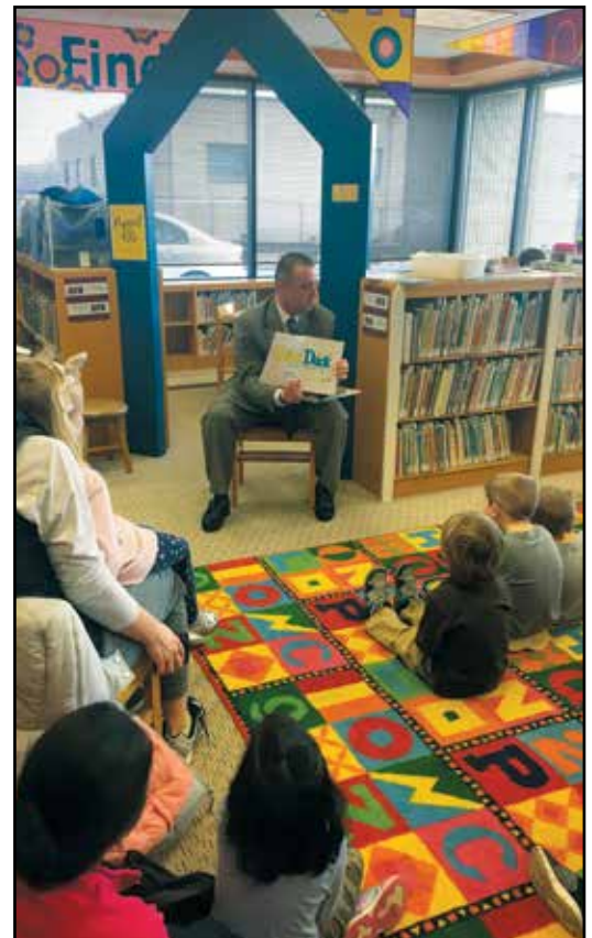
Rep. Deasy reading at the Green Tree Library.